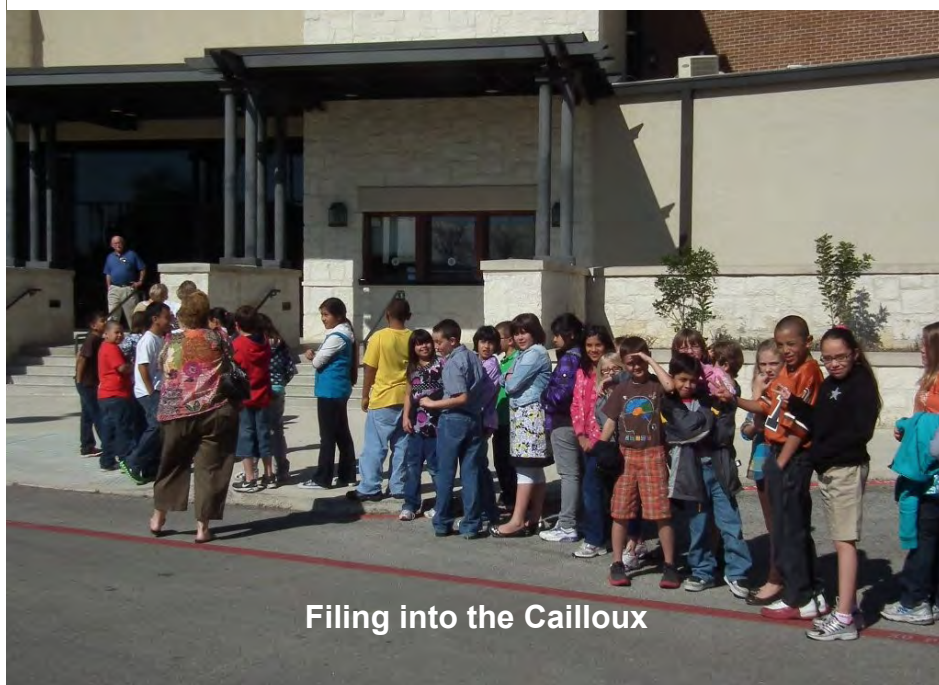
Filing into the Cailloux