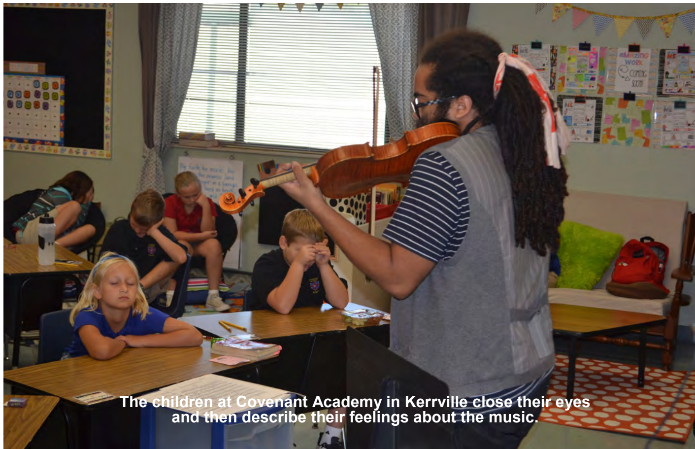
The children at Covenant Academy in Kerrville close their eyes and then describe their feelings about the music.

In classrooms or gyms at the several elementary schools, students heard music that was new to them and were encouraged to discuss the moods and feelings evoked by the music. They were introduced to the most well-known composers, the timelessness of classical compositions, the basics of the various instruments and orchestral sections and the stories told by the musicians of their journeys with music through childhood and career. As stated in the SoH Mission Statement, the objective of these programs is to encourage students to open their minds and thus gain a better understanding of the music that will at first be strange to them.