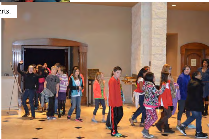
The Cailloux Theater